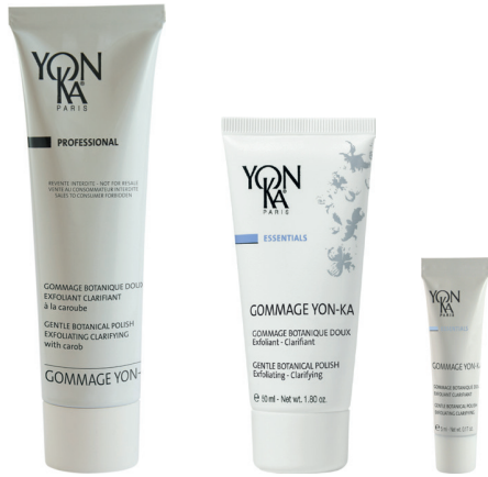
P. 100 ml